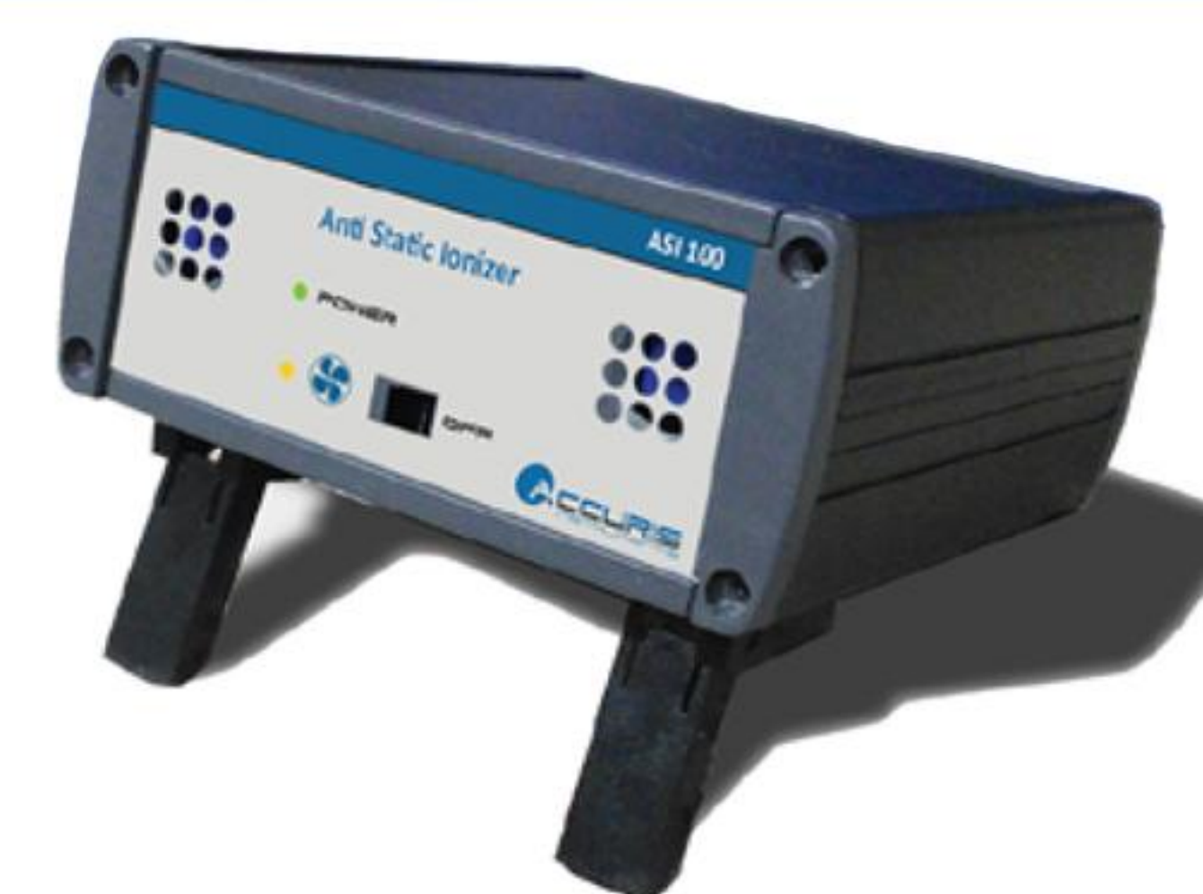
Compact Ionizer ES59139-ION

Static charge can accumulate on many types of samples as well as weighing containers, affecting mass determination on an analytical balance. The Accuris ASI-100 produces and emits negatively and positively charged ions that will neutralize static electricity on samples and containers. A blower can be turned on for rapid static discharge, or turned off for work with powders or light-weight materials.