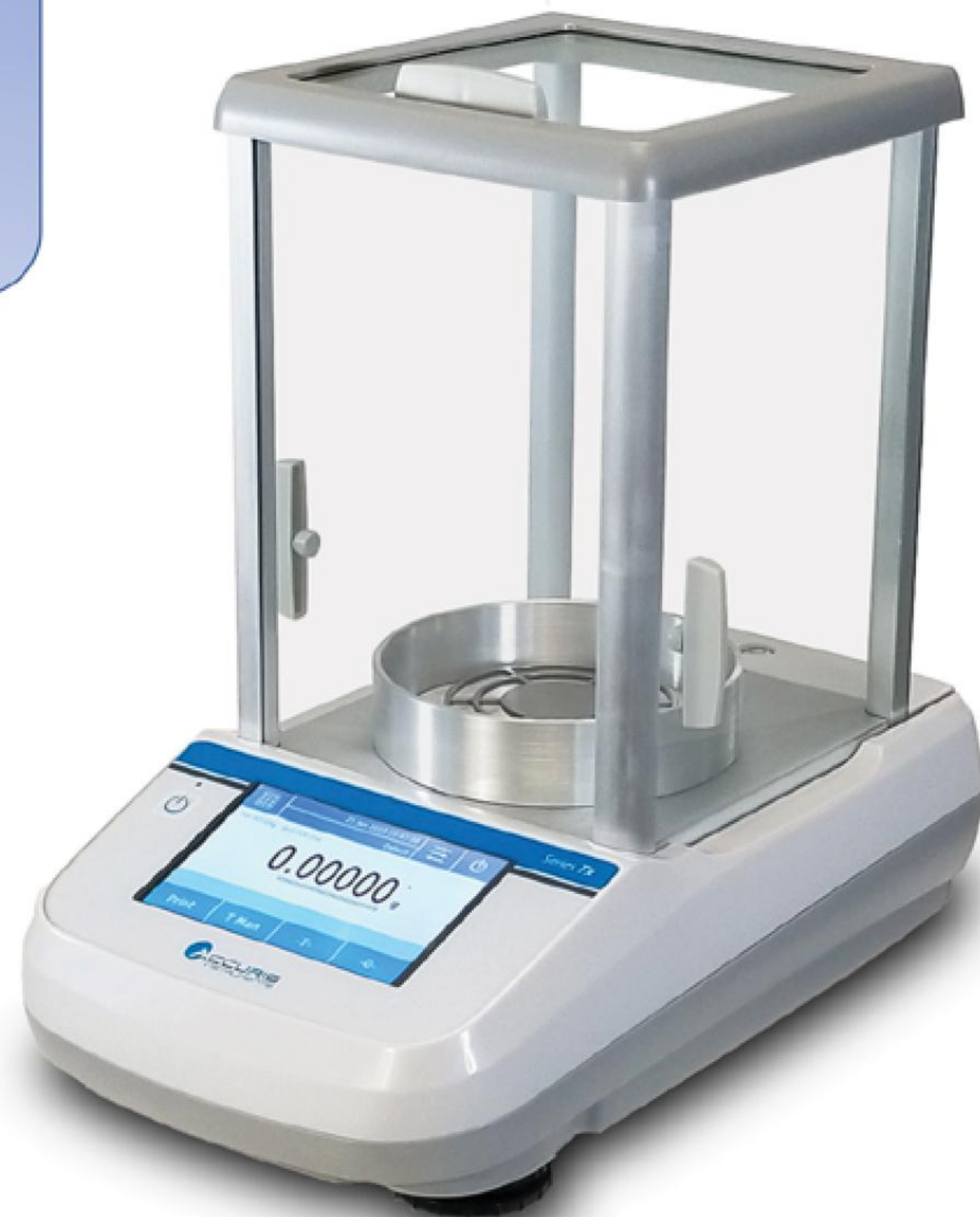
ES59135-120 Semi Micro Balance With Color Touch Screen

Readability: 0.1mg or 0.01mg Capacity: 120g or 220g