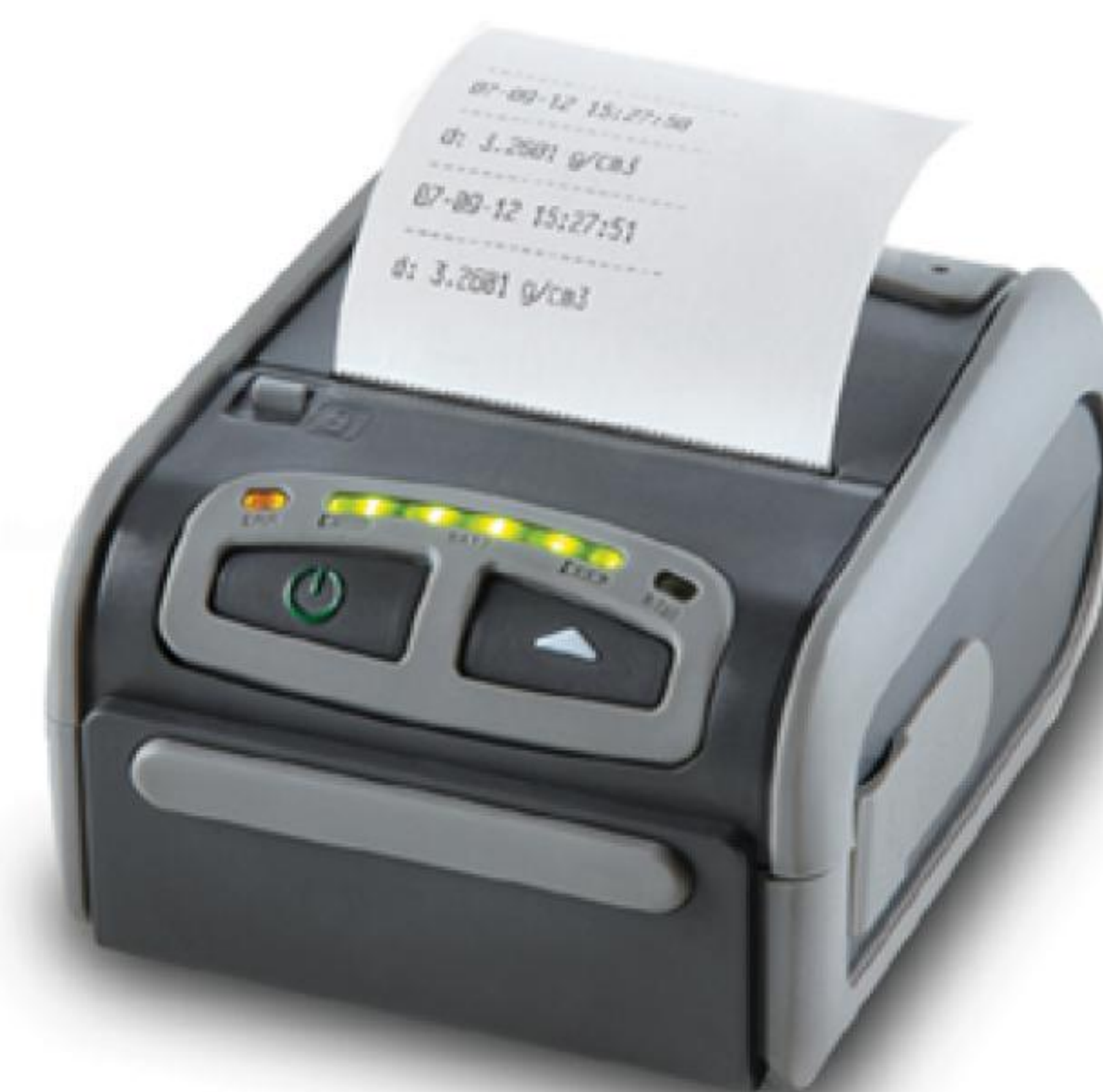
Thermal Printer ES59139-PRNT

The Thermal Printer offers a small footprint, modern design, and is compatible with Accuris series Dx and Tx Analytical Balances. Connection is easy with the included cables, and weight values and other critical info can be printed quickly and clearly. The printer connects to AC power (100V to 240V) with an included power adapter, and also features an included rechargeable Li-Ion battery.